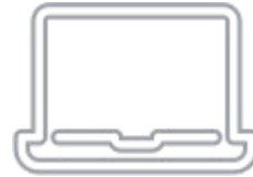
DVD, HDD and FTP