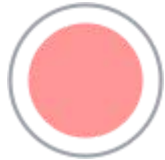
Recording of the broadcasts