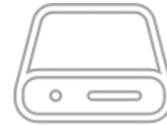
Additional NAS volume